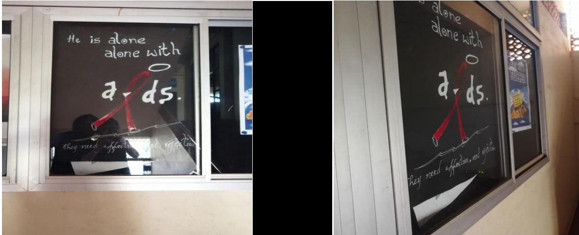
Some of the charts that were displayed