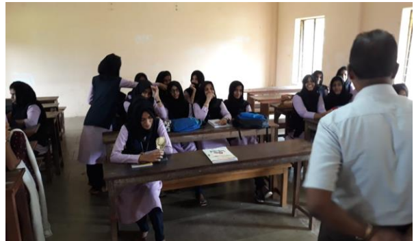
Principal addressing the students on utilizing teenage energy