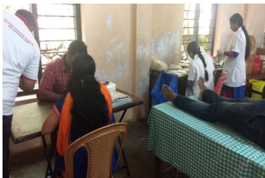
An RRC volunteer filling in details for donating her blood.