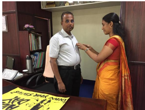
Observing the World AIDS Day by pinning the red ribbon for our Principal

The club also observed the World AIDS Day to admonish all the students of our college the different ways in which AIDS can occur. We displayed charts and a chain containing all the AIDS status (themes) so far. An essay writing competition was also organized as a part of the event on the topic “Know Your Status” (this year’s theme) and the winners were congratulated.