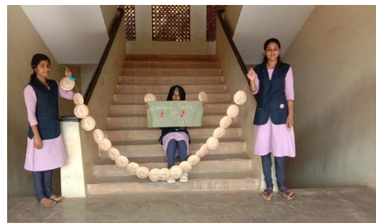
A chain containing the AIDS status of all the years. Changing themes of AIDS.