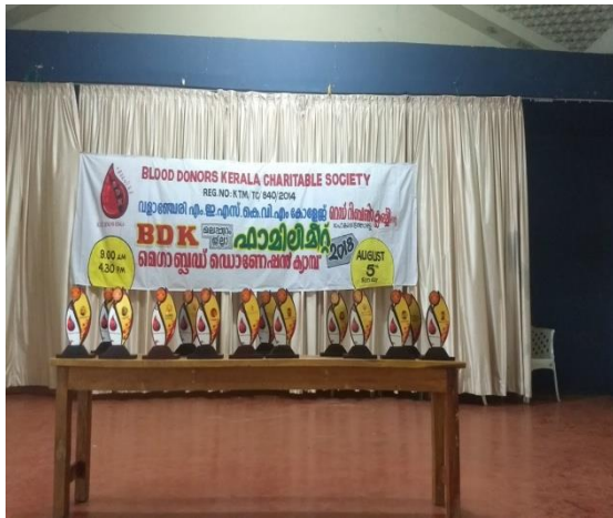
Red Ribbon Club Activity Inauguration