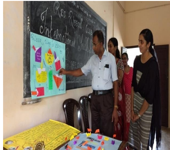
Principal inaugurating the function by unveiling the chart.